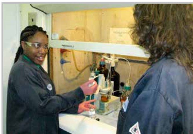
Vertellus team members give back to local communities by contributing their time, talents and funding.