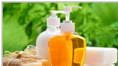
Vertellus manufactures safe and effective preservative alternatives for a wide range of leave-in and rinse-off product formulations.