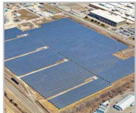
Formerly idle land owned by Vertellus is the site of a 43-acre solar farm